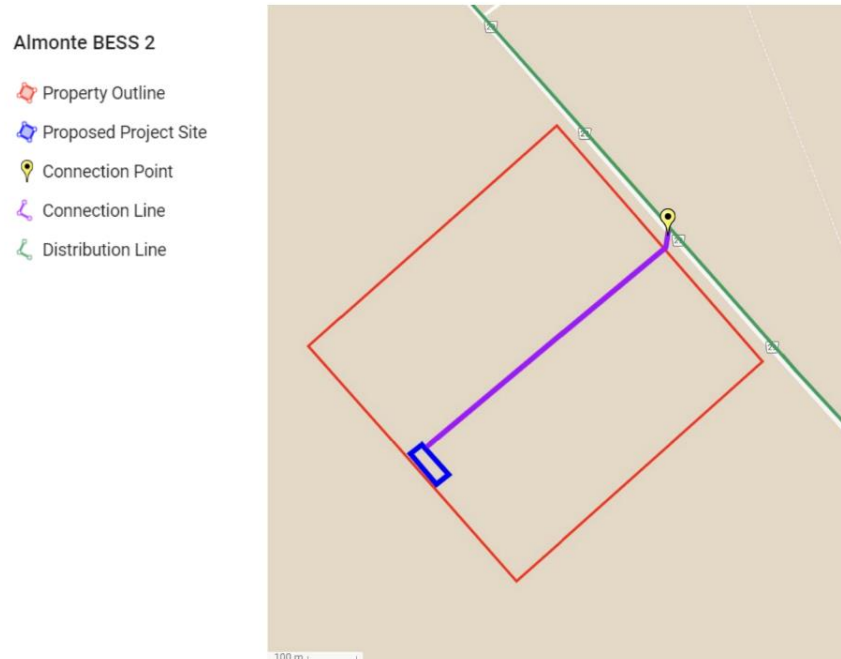
Figure 1: Almonte BESS 2 Scale Site Map

The competitive procurement process will assess and evaluate the Project against other energy storage and non-energy storage capacity proposals. Proposals offering the most competitive capacity prices may be awarded a 20 plus year agreement with the IESO. For additional Rated Criteria points, the IESO will look for Projects that have evidence of Municipal support and Indigenous ownership, described in Section 5 “Capacity Procurement Information”.